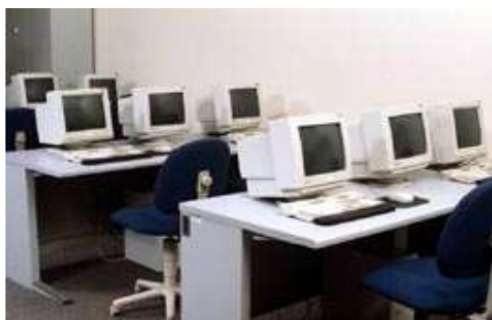
Public Access Computers Connected to Network