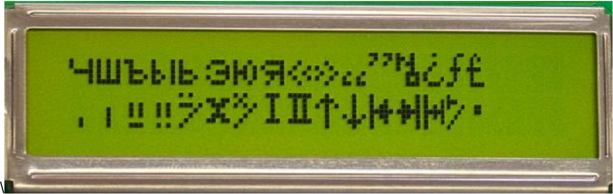
Actual Custom Message Screen 3 LCD Display