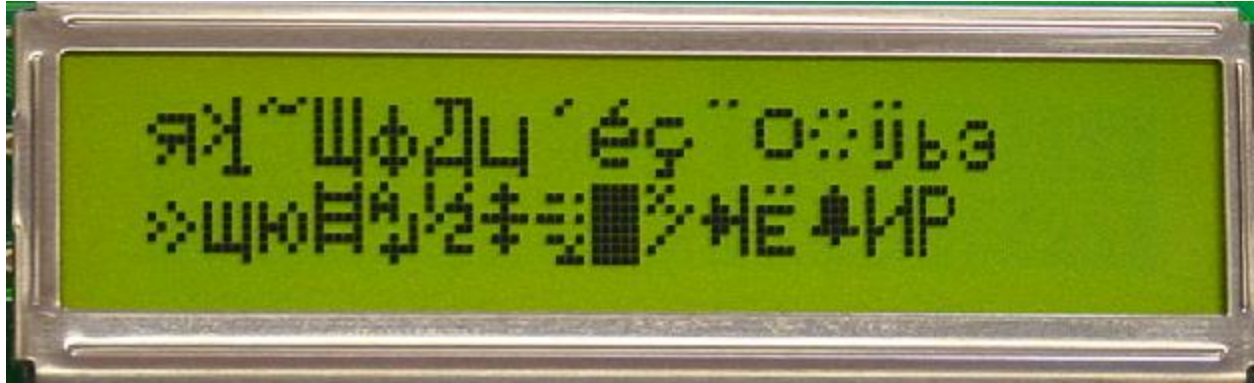
Actual Custom Message Screen 1 LCD Display