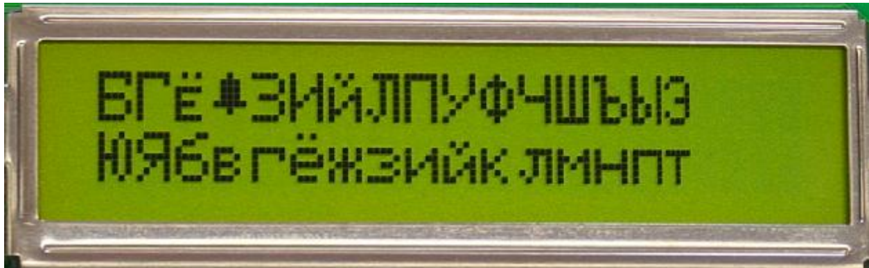
Actual Custom Message Screen 2 LCD Display