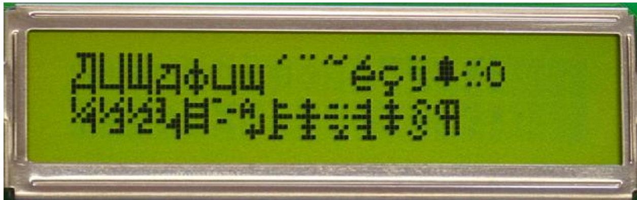
Actual Custom Message Screen 4 LCD Display