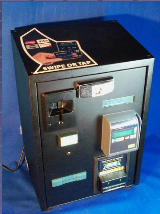
Card Dispenser Encoder