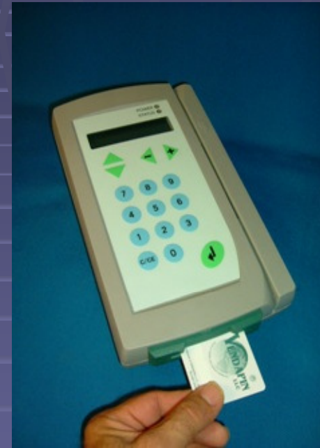
Card Terminal and Card

Note: credit card option pictured is additional/optional